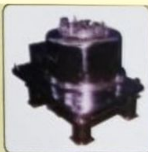
48" O FOUR POINT GMP CENTRIFUGE