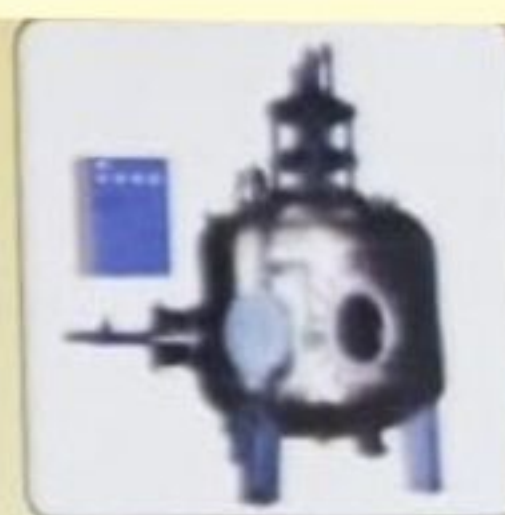
AGITATED NUTSCHE FILTER