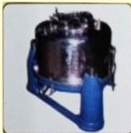
3PT STD MANUAL TOP DISCHARGE TYPE CENTRIFUGE